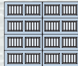
LQ • LP BEAD BOARD PANEL