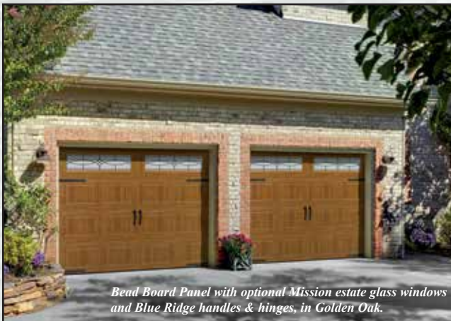
Bead Board Panel with optional Mission estate glass windows and Blue Ridge handles & hinges, in Golden Oak.

Self-expression shouldn't cost a fortune. With Delden's Vintage Plus Collection, it won't. These durable steel doors offer an attractive carriage house look. Choose from a variety of door colors, decorative hardware, and window accents. Customize your home with Delden's most affordable carriage house door.