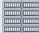
RE • RECESSED PANEL