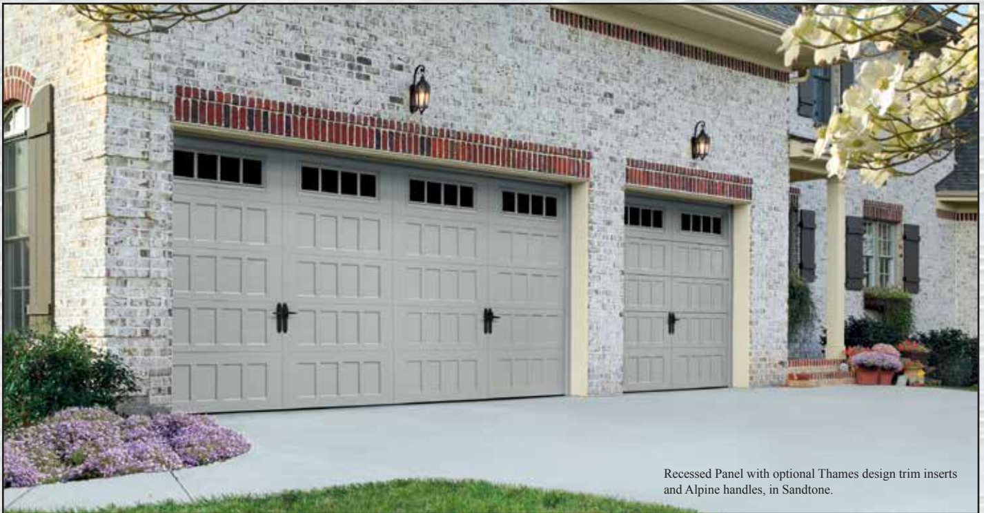
Recessed Panel with optional Thames design trim inserts and Alpine handles, in Sandtone.